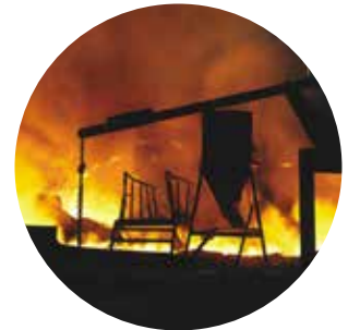
Higher temperature range