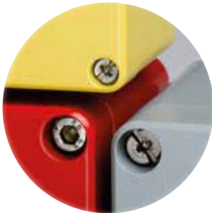
High resistance to chemical attack (painted)