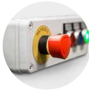
Designed for push-buttons