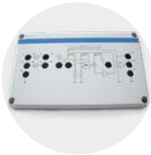
High-quality surface for printing