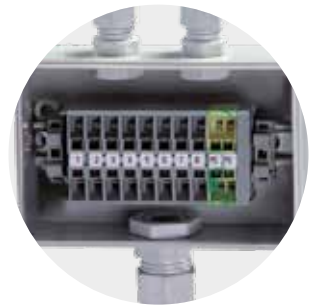
Optimised design for terminal blocks