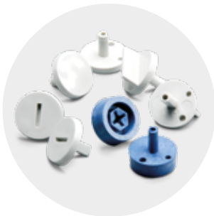
Quick locking cover screws for fast access to components