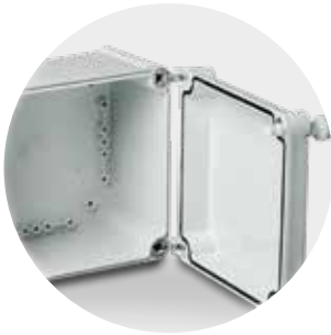
Wide opening hinges +180° for easy access