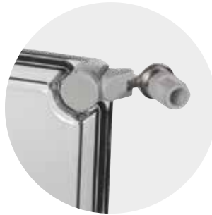
Guaranteed long-term ingress protection – no holes required in enclosure