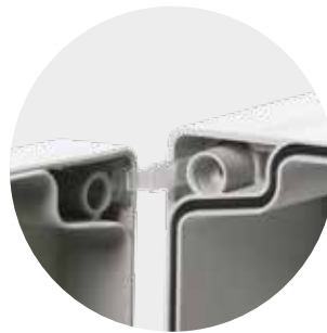
Quick-to-install integral hinge in selected sizes