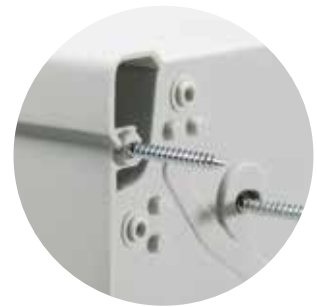
Multiple wall mounting options