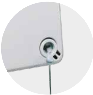
Sealing availability for added security